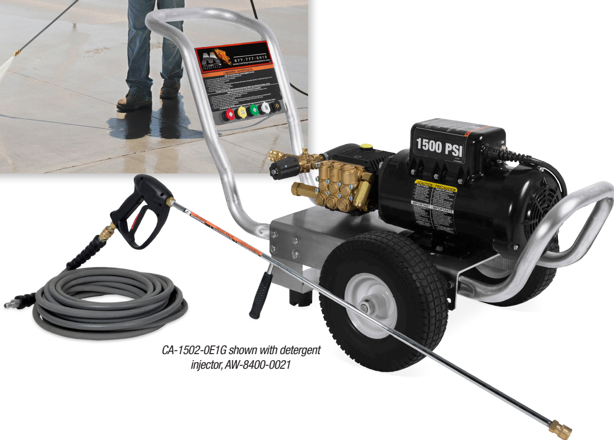
CA-1502-0E1G shown with detergent injector, AW-8400-0021